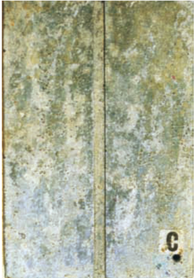
A 6 mm-wide cut groove through a 60 µm-thick zinc coating on steel and exposed for 5 years in a heavy industrial environment in Holland. Note the coating of zinc salts in the groove which has not been attacked by corrosion.

If you have any questions, please contact: